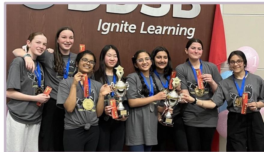
2024 Regional Intermediate Champions, Jack Miner Public School (Whitby)