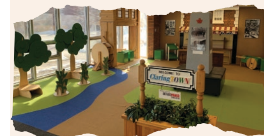
Sarah Jane Williams Museum