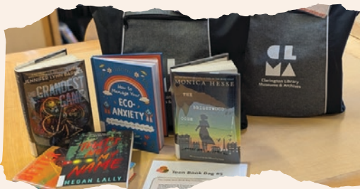
Teen Book Bags