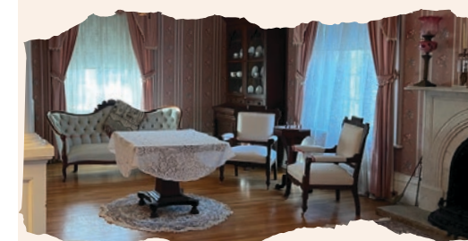
Waverley Place Museum